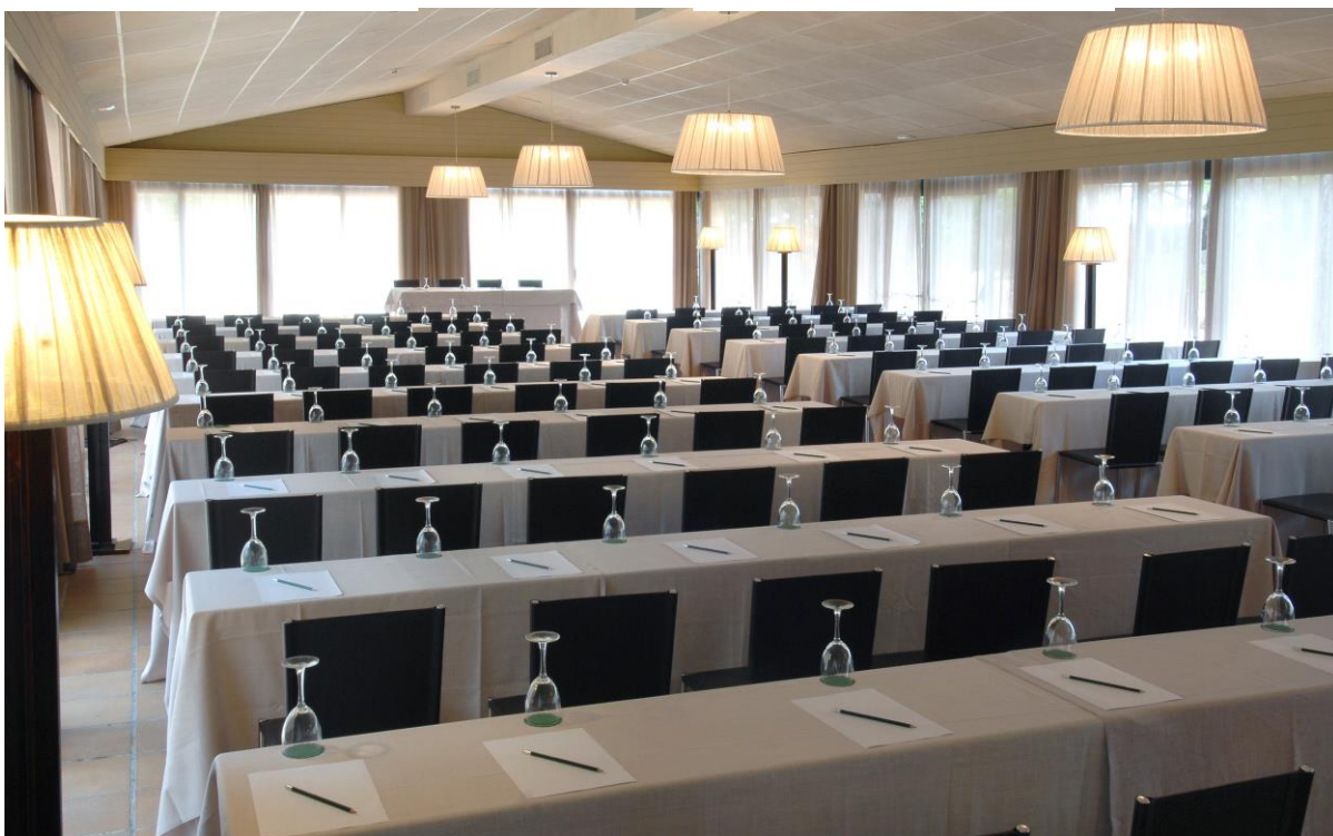
Gran Salon Empordà